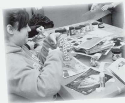
Printmaking Residency, David Brearley High School, Kenilworth