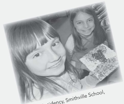
Mosaic Residency, Smithville School, Galloway Township