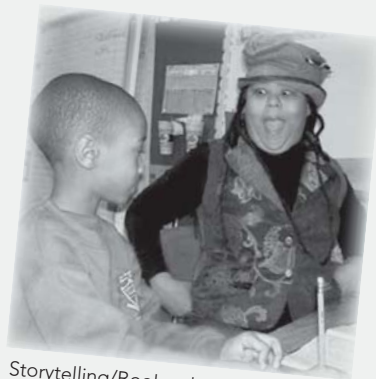
Storytelling/Bookmaking Residency, Trenton Community Charter School, Trenton