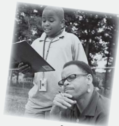
Poetry Residency, Joseph Stokes Memorial Elem. School, Trenton