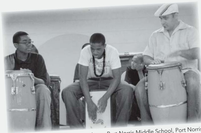
Percussion/Latin Dance Residency, Port Norris Middle School, Port Norris

"I think art is the best thing—like a colorful butterfly flying by. I think art is like a blue bird flowing in the wind. I think art is like a land where people are free and having a good time. Art is my heart. Art is me. Art is like a peaceful quiet song going through my ears. My art is my soul and my body. Art has many secrets so it is my job to find out."