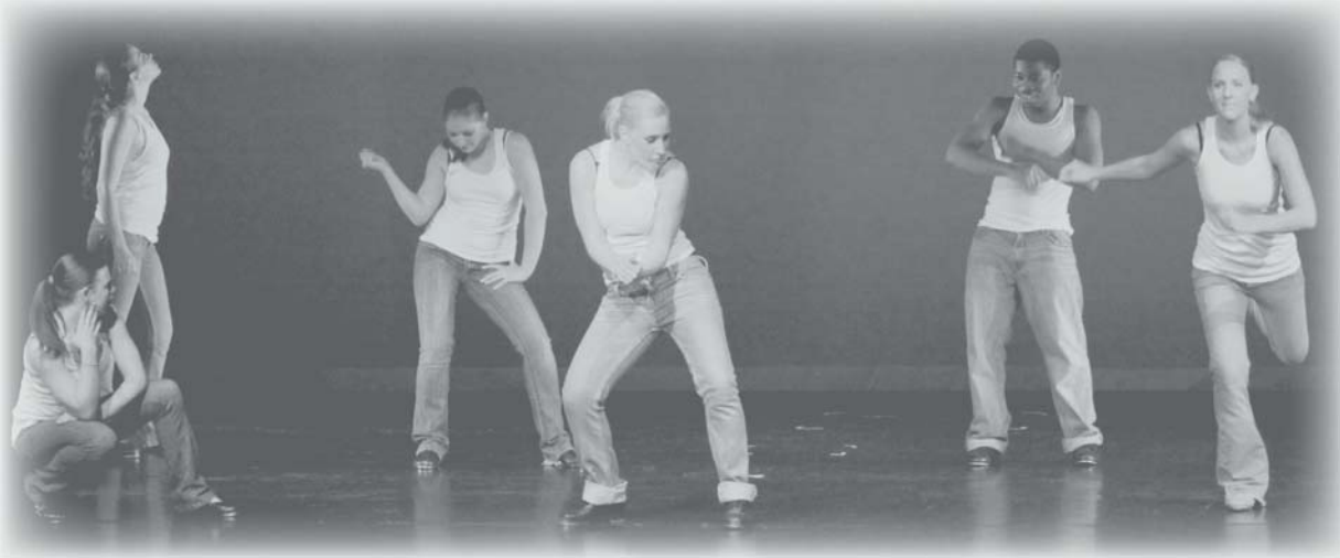
Tap Dance Residency, Middlesex County Vocational and Technical High School, East Brunswick

One-Year AIE Residency Grant Two-Year AIE Residency Grant Planning & Implementation AIE Grant